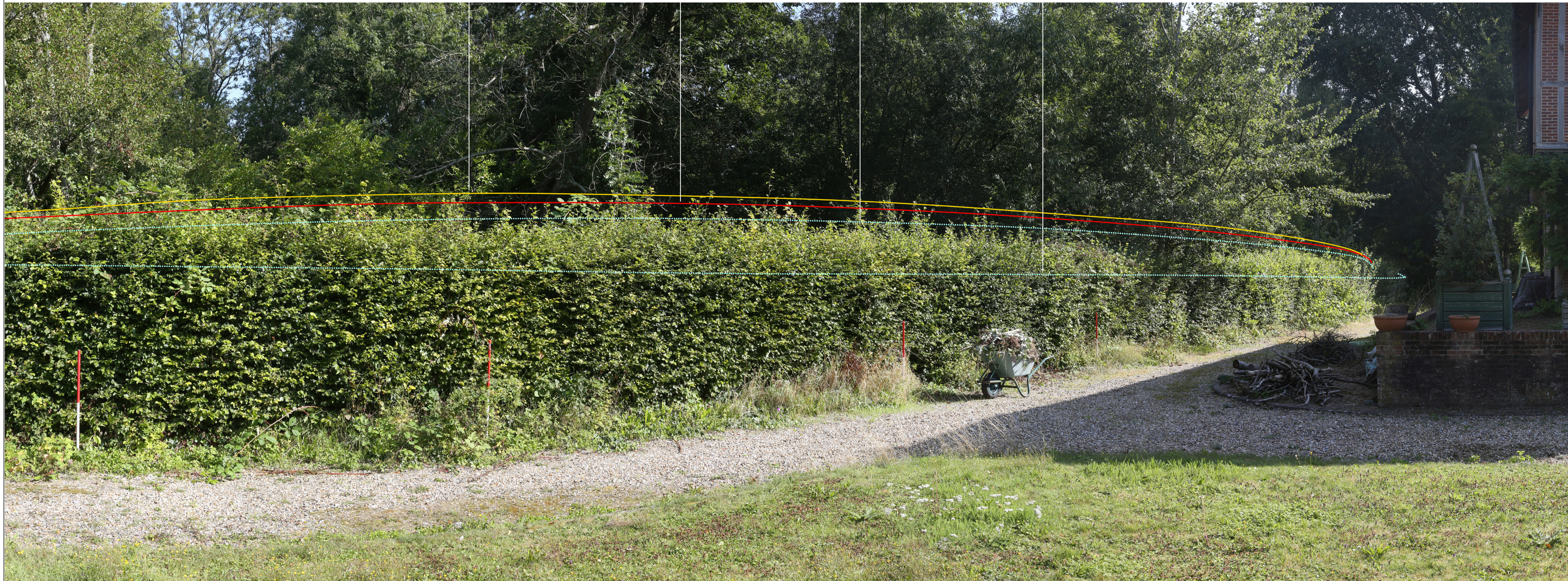
PROPOSED (SUMMER YEAR 15)

Lower blue dotted line indicates road level of slip road